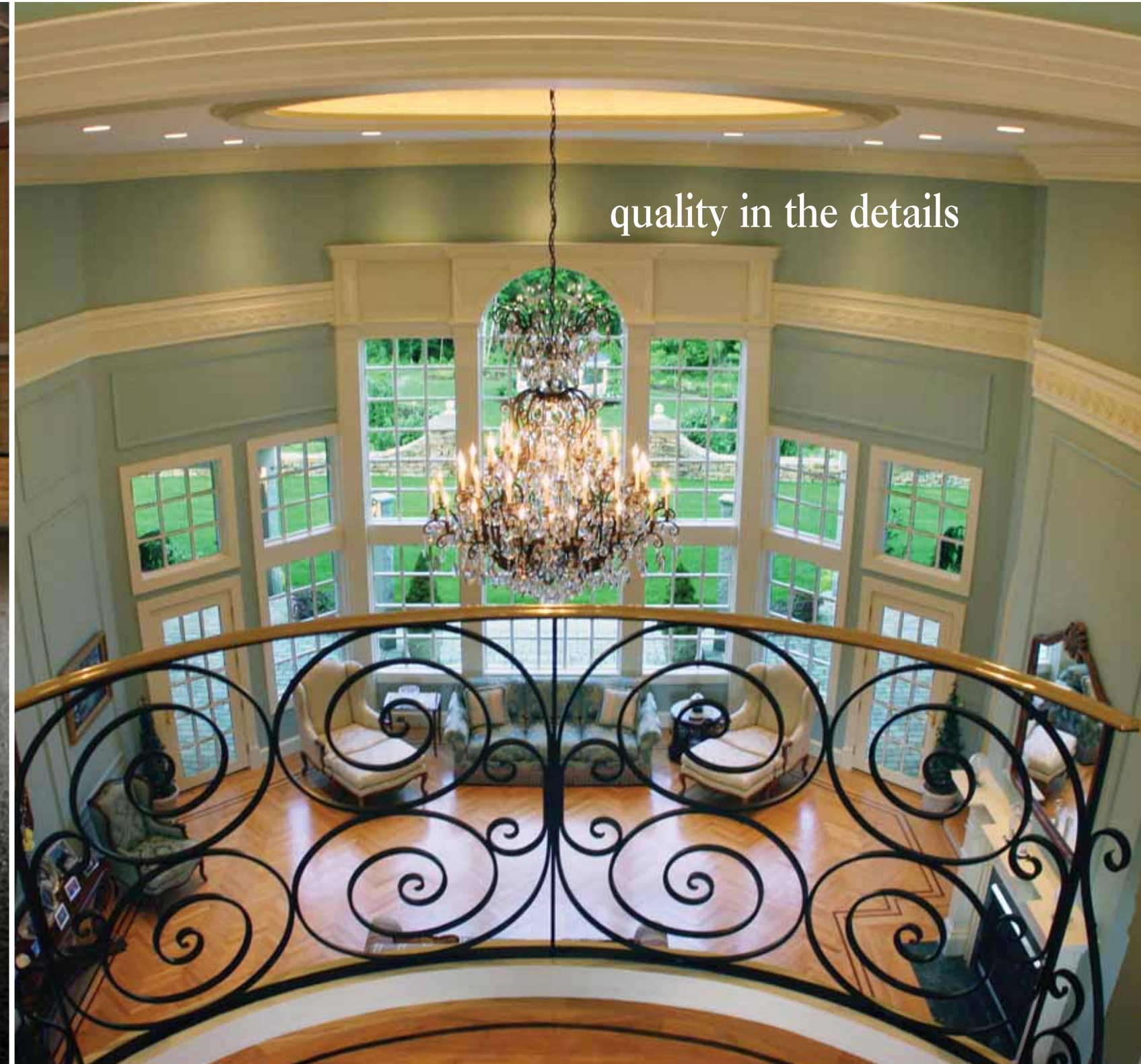
quality in the details